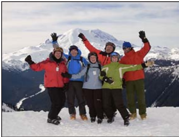
SCENES FROM WINTER BLAST 2006