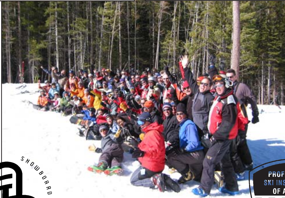
SCENE FROM ACADEMY 2004